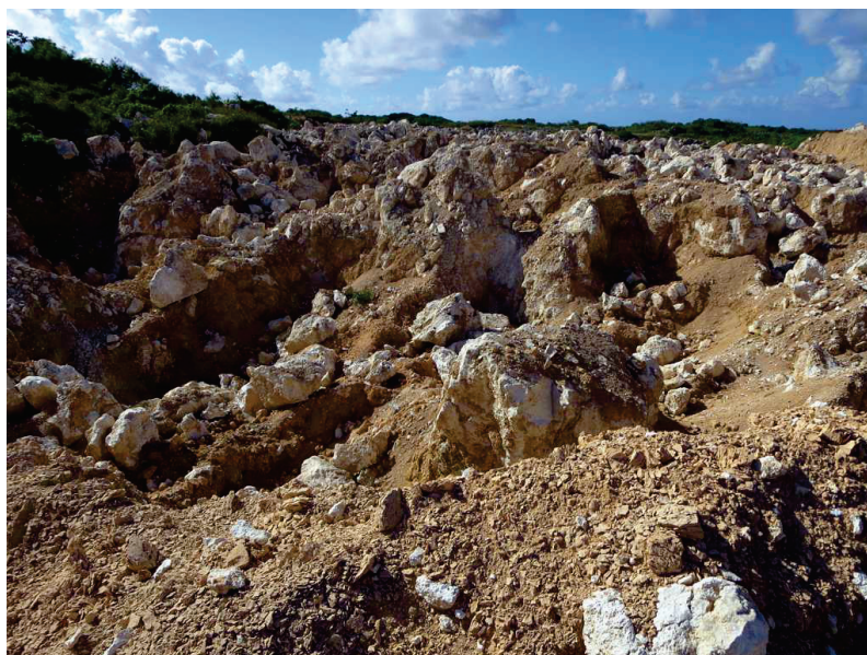
Phosphate rock mining continues at this quarry on Christmas Island, Australia