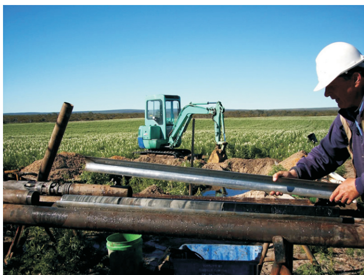
Drilling at the Central West coal project, Eneabba.