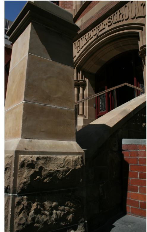
▲ Some of the geological sites across Perth, Western Australia