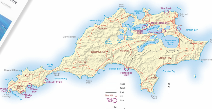
▲ Location map of Rottnest Island, Western Australia