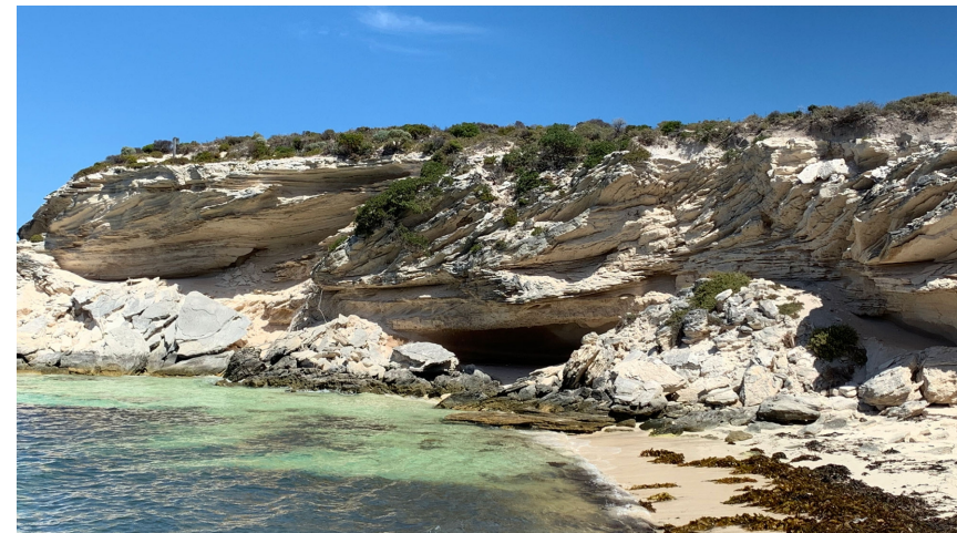
▲ See exposed Tamala Limestone cross-bedding at South Point.