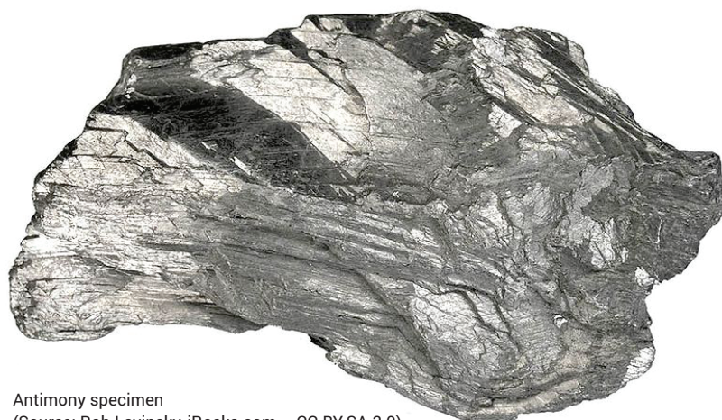
Antimony specimen