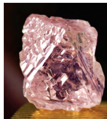
Pink Diamond from Argyle Diamond Mine