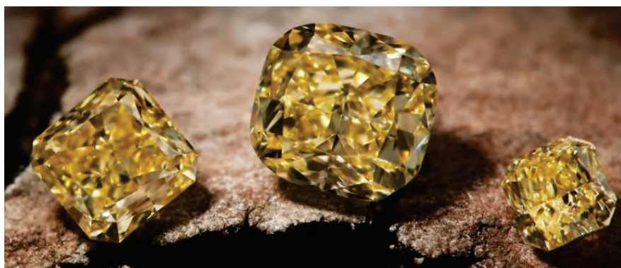
Fancy Yellow diamonds from India Bore's exploration project