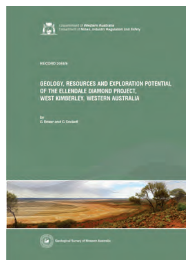
Products released by DMIRS