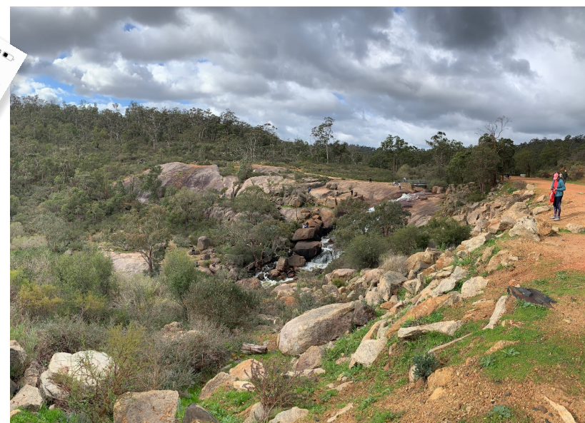
▲ Views of the National Park Falls